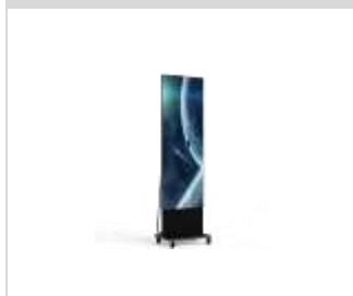
LED Poster Display—Tilt Bracket