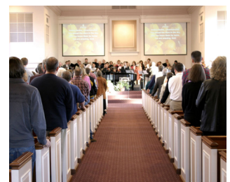
House of Worship