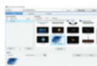
Epson Content Manager